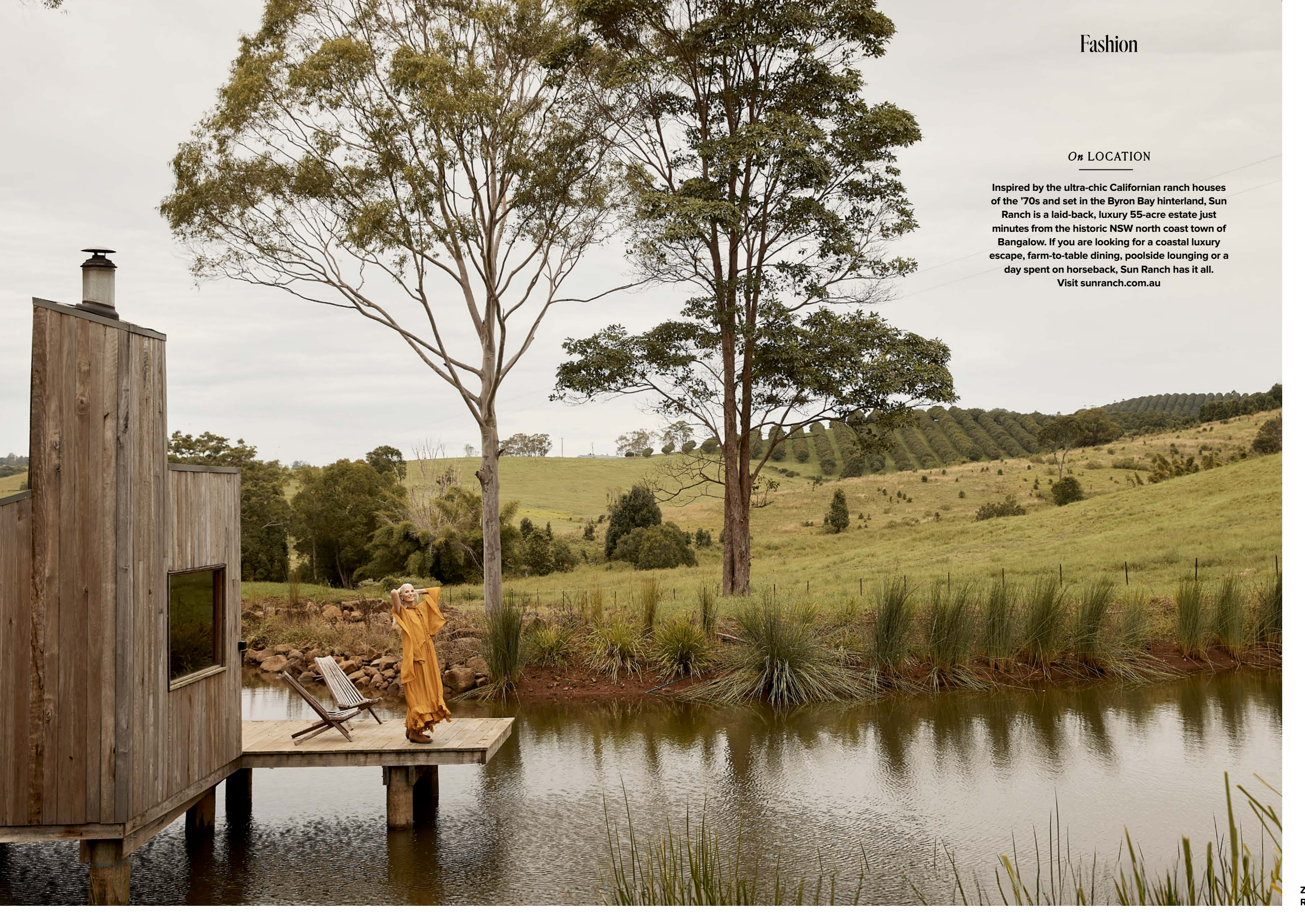
Zara dress, $459. R.M. Williams boots, $899.